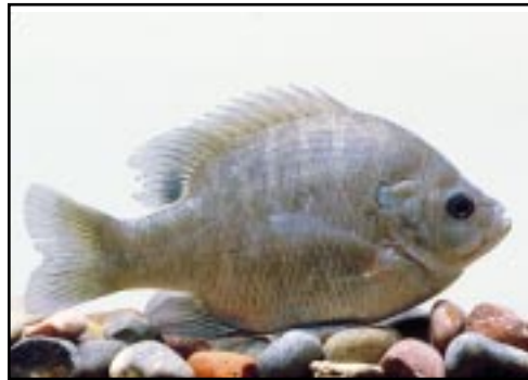
Figure 3. Bluegill make excellent continuous forage for bass.

Transferred fry are more uniform in size if individual schools are seined. All fry should be the same age, as nearly as possible, because fingerlings become cannibalistic at about 2 inches in length. There-