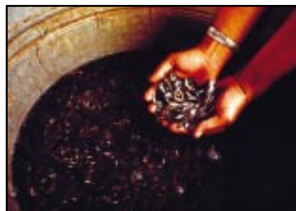
Figure 2. A mixture of live forage fish is used as supplemental feeding. For growth, 10 pounds of forage per pound of bass growth is required.

Fill the pond with well water or surface water filtered through 52 mesh/inch saran socks. The pond should be filled only a few days (up to 14) before stocking to reduce the buildup of predacious insects. Spawning ponds should be fertilized when spawning