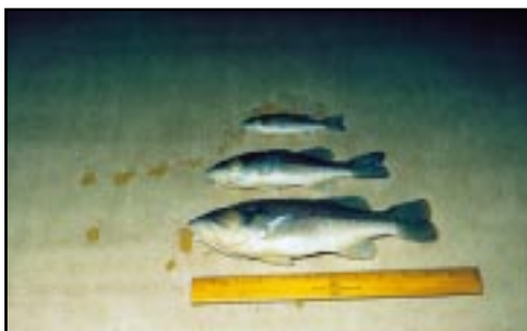
Figure 1. These largemouth bass are all 1 year of age. Growth rate is largely dependent on available food.

Producers of largemouth bass fingerlings and stockers should be aware of the genetics of their brood stock. Though there may be a desire to use brooders from off-hatchery sites, they should be from the local area under most situations. Strain selection depends on market demand and suitability for your market area. Florida strains are popular in warmer southern areas because they usually grow to a larger maximum size. There are conflicting data on growth rates of Northern and Florida strains. This is particularly true for growth during the first year. In addition, pure Florida strains are subject to winter-kill, especially in shallow culture ponds during prolonged sub-freezing weather. The use of scale counts along the lateral line and/or coloration are not reliable techniques for differentiating between the two sub-species. Positive strain identification requires sophisticated electrophoretic techniques. Contact the state Extension service for information on electrophoretic testing and strain recommendations.