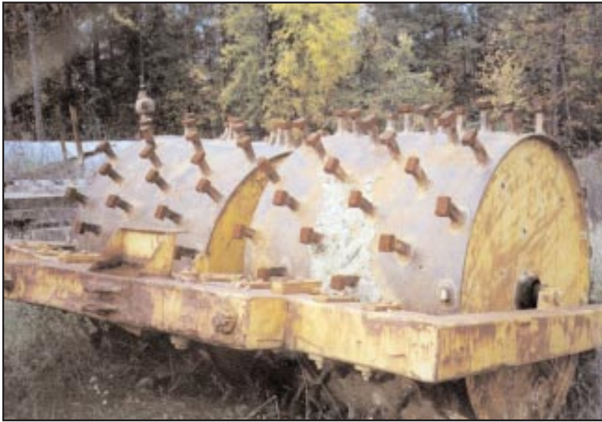
Figure 1. Sheep's foot roller.

the soil on the feet extending from the drum. Adequate compaction will require at least four to six passes of the roller over all of the pond bottom and sides. Tractor-drawn wheeled dirt pans also can be used over the dam or levee, although they do not compact as well as a roller.