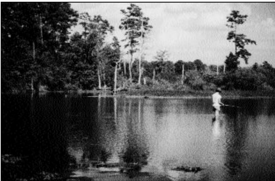
Figure 5. Liability insurance must be provided at all fee-fishing operations in the event that someone is injured.

For additional information on fee fishing and pond management, contact your local county Extension agent, state fisheries specialist, local USDA Soil Conservation Service office or the nearest office of your state Fish and Game Commission. Phone numbers for these agencies are listed in the government section of your phone book.