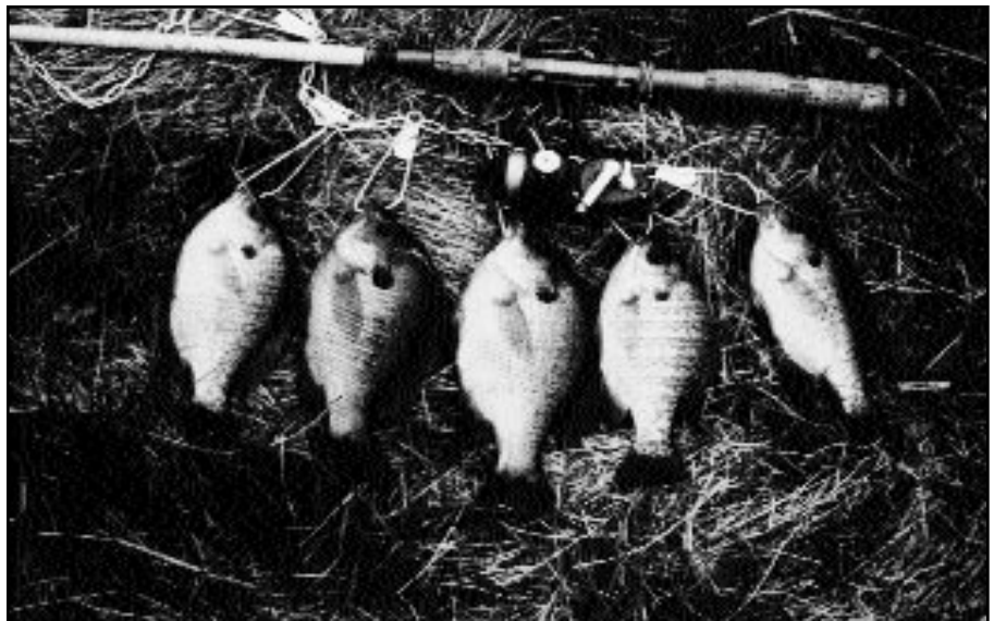
Figure 2. Natural fish production provides most of the angler harvest at day leases.

Most of these ponds are located close to a public road. Appropriate signs allow easy recognition by individuals travelling in the area. Angler harvest relies primarily on the natural production of the pond, including largemouth bass, bluegill, redear sunfish and crappie. However, channel catfish may be supplementally stocked to attract more anglers by increasing harvest.