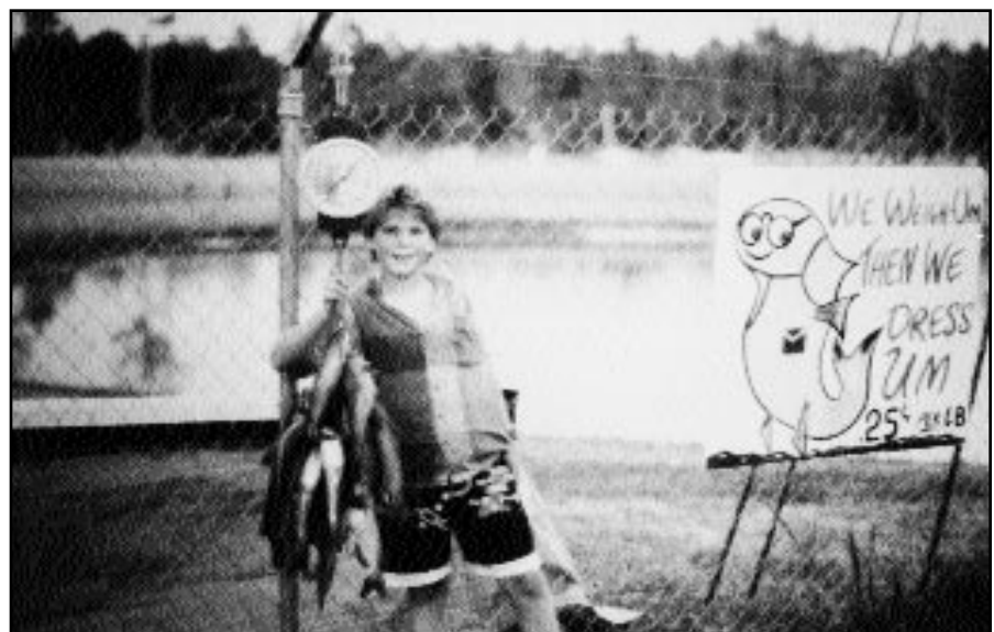
Figure 3. Children like to fish at fish-out ponds because of the high likelihood of catching fish.

Fish-out operations should have a minimum of two ponds, allowing anglers to select where they fish. Having more than one pond