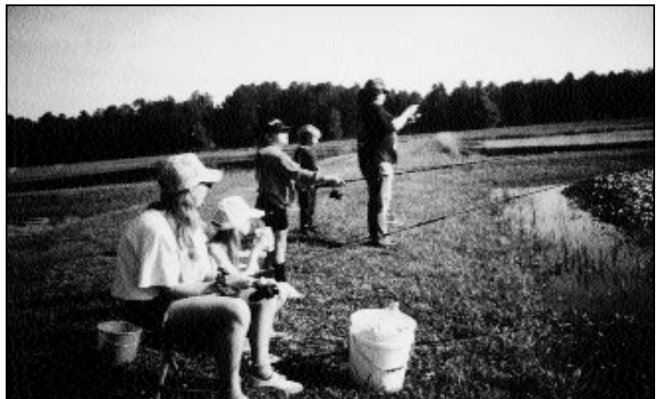
Figure 4. Day lease and fish-out pond operators must be willing to deal with people.

Fee-fishing operations are good markets for fish producers. Production acreage in many states is small and geographically dispersed. Producers can sell their fish live to local fee-fishing operations. Thus, there is no need to build a processing facility, and many state health regulations can be avoided by selling live fish. Producers can often get a higher price per pound from fee-fishing operators than from processors.